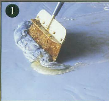
1 Scraping softened epoxy floor paint

Removes Multiple Layers of: Epoxies, Acrylics, Paints, Urethanes & Polyurethanes From - Concrete, Metal & Wood Surfaces