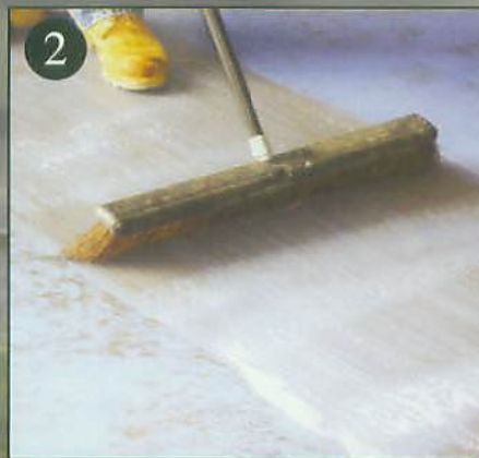
2 Scrub floor with degreaser